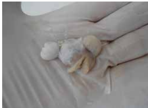
Figure 1. The view to the delivered material.

Mark Special Stains (Roche Diagnostics GmbH, Mannheim, Germany) for detection of polysaccharides with PAS Staining Kit Ventana® (Ventana medical System, Inc., Tuscon, Arizona, USA) and for the verification of collagen with Trichrome Staining Kit Ventana® (Ventana medical System, Inc., Tuscon, Arizona, USA). The last slices were stained with immunohistochemistry with Ki-67 to detect cell proliferation (Lindboe and Torp, 2002).