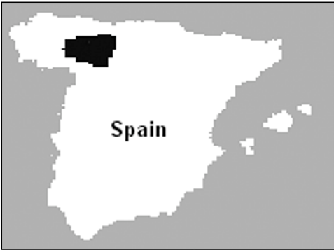
Figure 1. Geographic location of the province of León, NW Spain.

The ongoing cost of SRB infection and control in Spain is significant. The Spanish small-ruminant census, more than 26 million heads, accounted for almost 25% of the European Union (EU-15) census in 1999. 6 The cost of SRB in Spain, therefore, comprised a significant piece of the EU animal health budget. 7 Moreover, a total of 1,548 cases of human brucellosis (HB), most of them due to B. melitensis , were diagnosed in 1999 in Spain. 8 The decrease of HB incidence during the last decade (from 4,217 cases in 1989) has paralleled the decline of animal brucellosis, thus suggesting the need for the eradication of animal brucellosis if human brucellosis is to be eradicated.